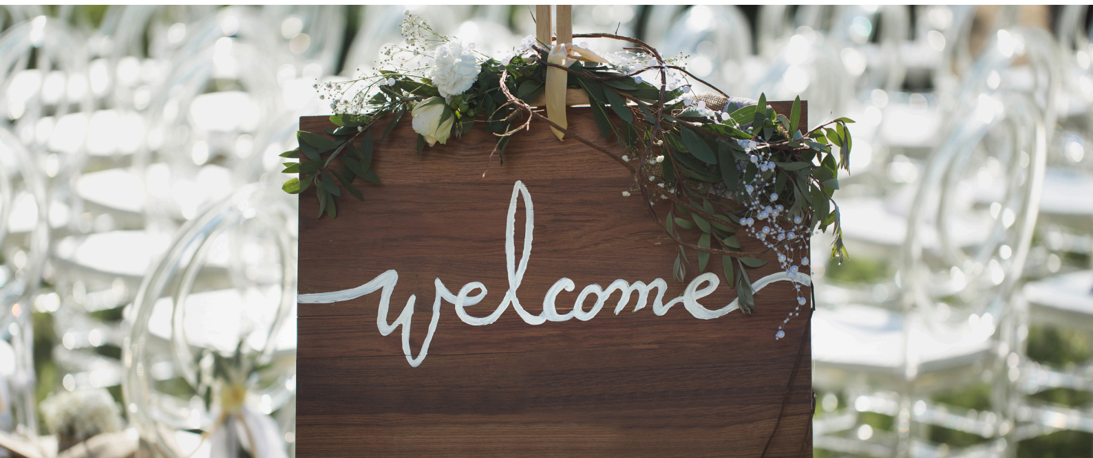
Simple wedding signage

12. Signage: Use elegant signage to guide guests and add a decorative simple touch.