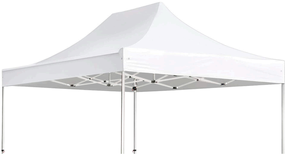
Pop up gazebos

15. Weather Contingencies: If outdoors, have a backup plan and consider hiring canopies .