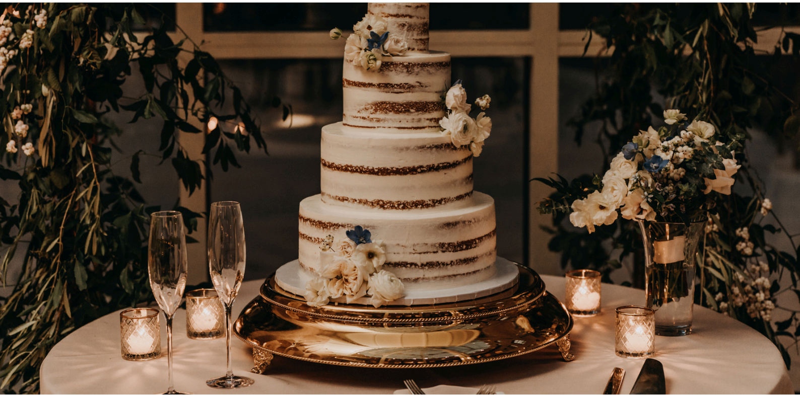
Simple and effective

33. Dress Up the Cake Display: Consider a dedicated table for your wedding cake that matches your decor theme.